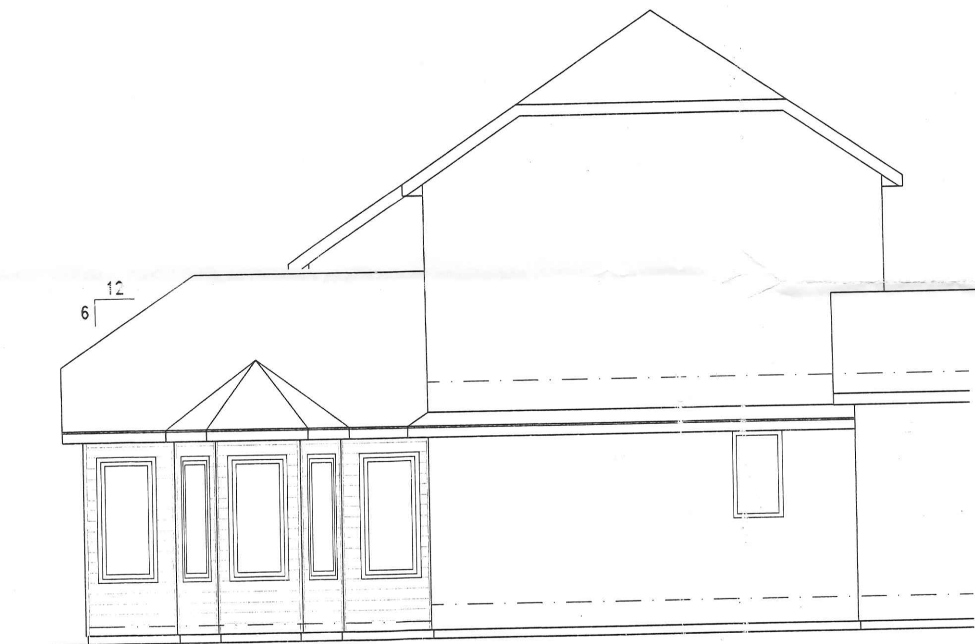
WEST ELEVATION SCALE: 1/4"=1'-0"