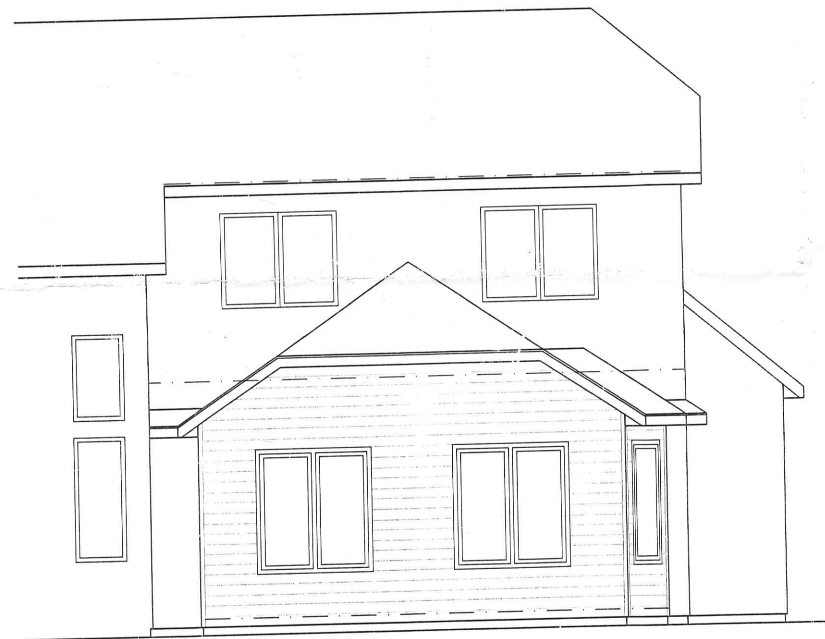
NORTH ELEVATION SCALE: 1/4"=1'-0"